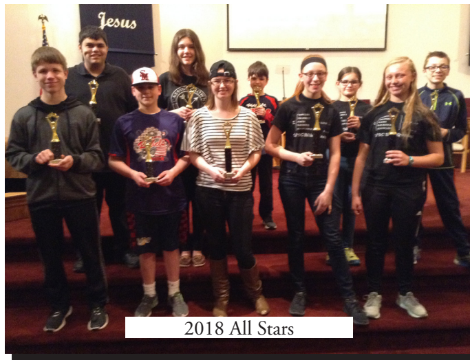
2018 All Stars